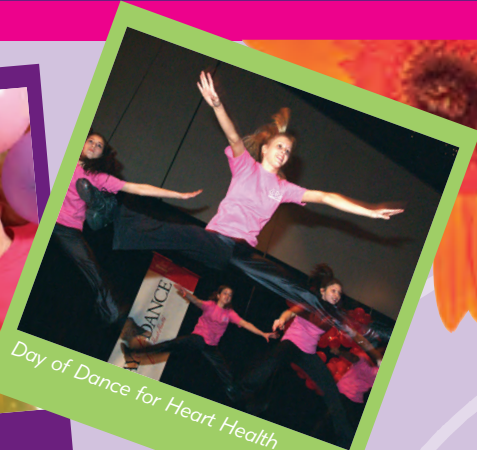
Day of Dance for Heart Health